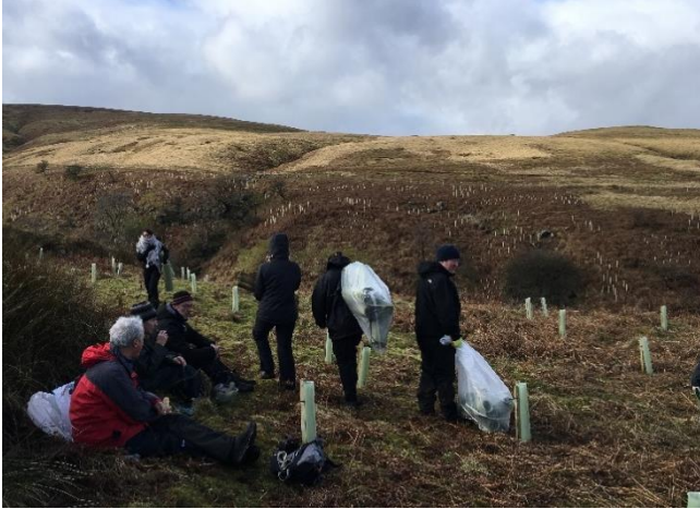
Volunteer tree planting in Wharfedale

We understand that as river levels rise, we cannot continue to build walls and banks indefinitely. To counter the effects of climate change over the next 100 years we are looking at how river flows could be slowed and managed in areas upstream of York.