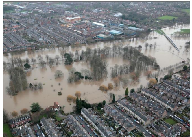
Flooding by Rowntree Park and Millennium Bridge

On 22 May, we are holding a public event which will focus on the options for reducing flood risk between Rowntree Park and St Chad's Wharf.